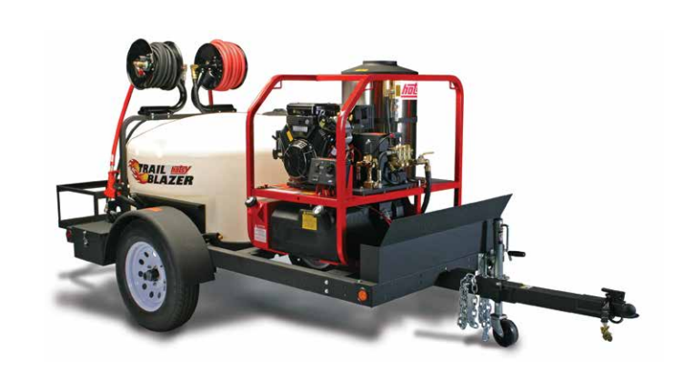
Shown with 1080BE and optional accessories