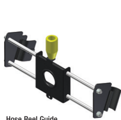
Hose Reel Guide