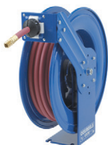
8.723-649.0 (hose and ball stop not included)

Coxreels offer high performance in a very compact and lightweight hand crank or spring-driven hose reel. Perfect for mobile application and permanent floor and wall mount.