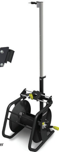
Hose Reel Riser