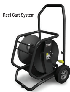
Reel Cart System